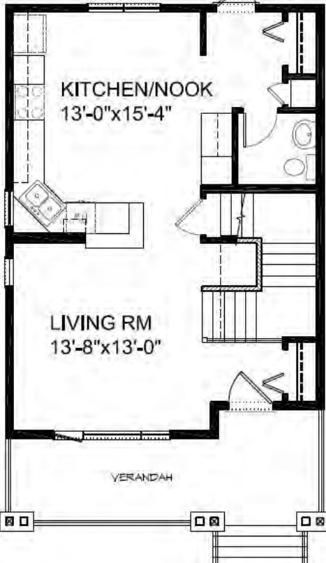
Main Floor 645 SQ. FT.

Visit us at our NEW WEBSITE at www.ehrenburg.com