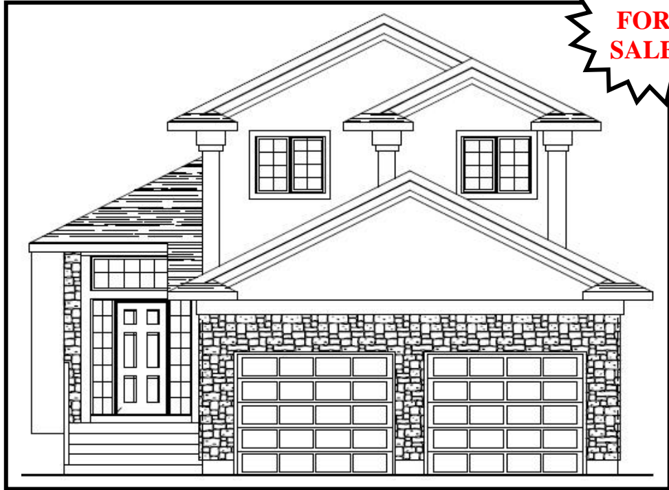
215 Alm Crescent - Stonebridge